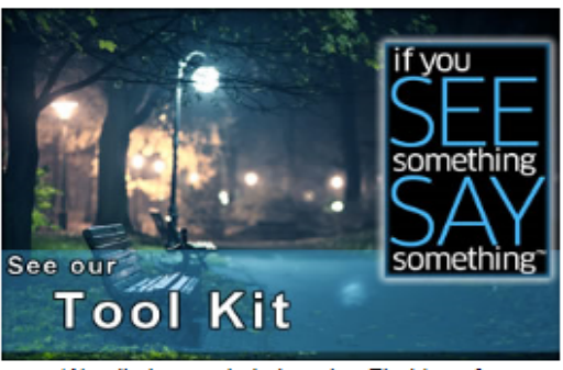
We all play a role in keeping Florida safe. This tool kit provides safety information and training for businesses and citizens.